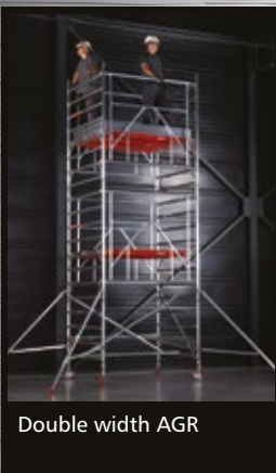
Double width AGR