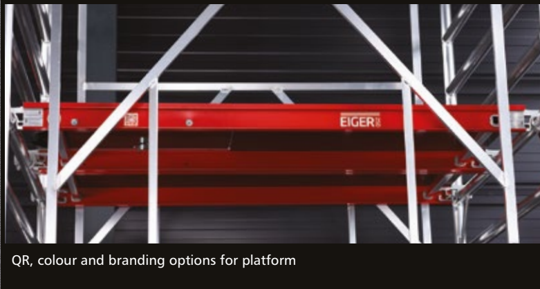
QR, colour and branding options for platform