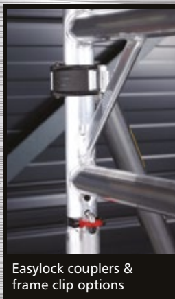
Easylock couplers & frame clip options