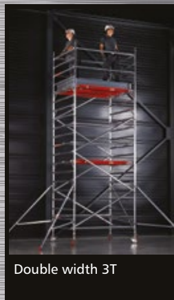
Double width 3T