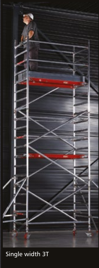
Single width 3T