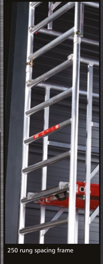
250 rung spacing frame