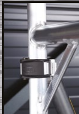
Easylock couplers option on stabilisers