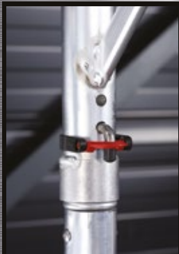
Integrated frame clip option