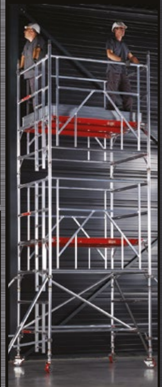
Double width AGR