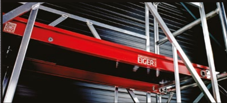
QR, colour and branding options for platform