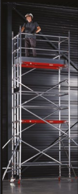
Single width 3T