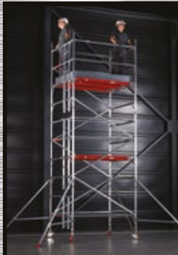
Double width 3T